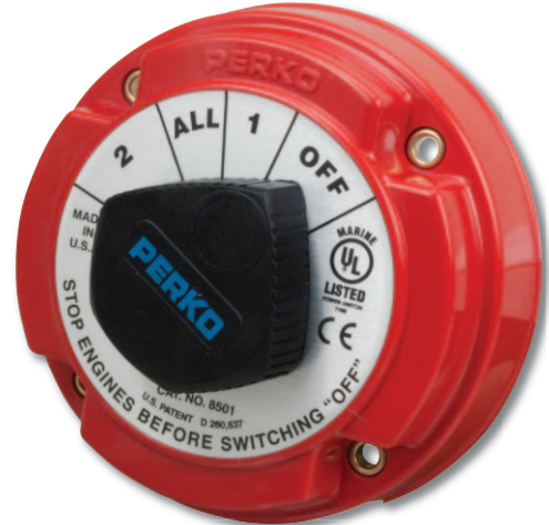
Fig. 8501 Selector Switch