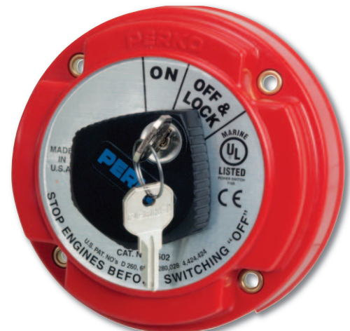
Fig. 9602 Disconnect Switch with Ley Lock