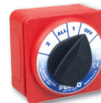
Surface Mounting Trim Ring Available