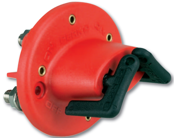
Fig. 8521 Selector Switch