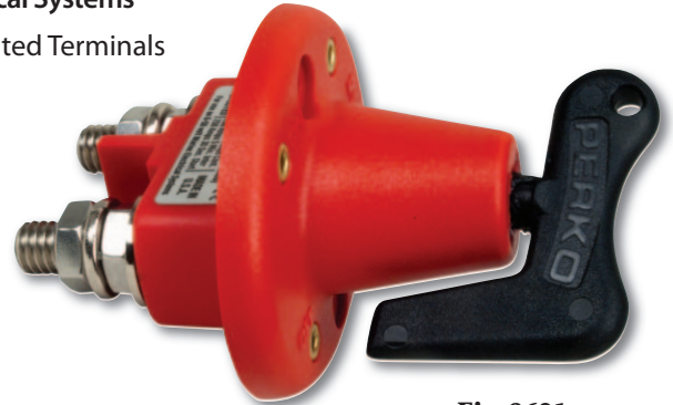
Fig. 9621 Disconnect Switch

Mounts On: Consoles, Lockers, Storage Bulkheads, Interior Gunnel Walls or Under Bench Seats