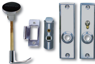
Fig. 0567 Shown Assembled

Retail Pkg. 0567DP0CHR OEM Bulk Pkg. 0567000CHR